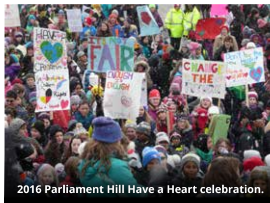
2016 Parliament Hill Have a Heart celebration.

Have a Heart Day is a child- and youth-led reconciliation campaign that brings together caring Canadians to help ensure First Nations children have what others have. This year, there were more than 40 Have a Heart Day events across Canada with over 5,500 Canadians celebrating.