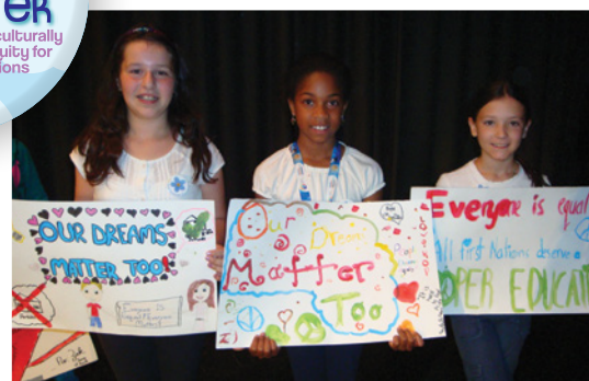
Our Dreams Matter Too Gathering in Ottawa, June 11, 2014..