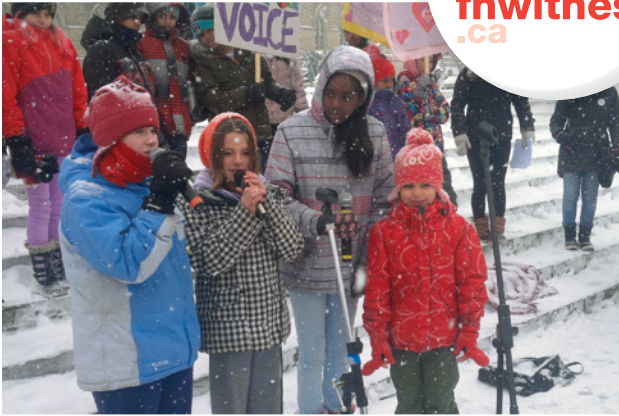
Have a Heart Day on Parliament Hill, February 14, 2014.

The Caring Society supports Have a Heart Day celebrations across Canada with free education and event resources available on the event webpage. The event page also offers a gallery with links to videos and other resources to support video and audio learning preferences. Have a Heart Day would not be possible without the generous support of our partners, such as the labour movement, professional teachers' organizations, Project of Heart, KAIROS and Amnesty International Canada.