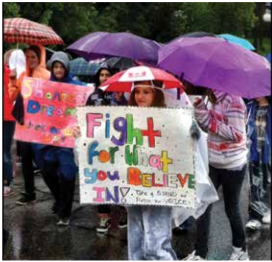
Fairness matters—rain or shine. Children at the Our Dreams Matter Too Walk in Ottawa/Gatineau 2012.

Matter Too walk in the Northwest Territories! All walk organizers received a Certificate of Appreciation thanking them for their leadership and participation. A full list of supporting organizations is available on the Our Dreams Matter Too website at: www.fncaringsociety.com/our-dreams-matter-too