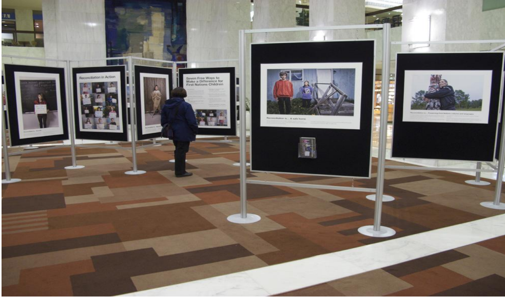
Caring Across Boundaries Photography Exhibition, First Canadian Place, Toronto, November 2009

Here are just a few of the many positive we received comments from people who went to see the photography exhibition at First Canadian Place in Toronto: