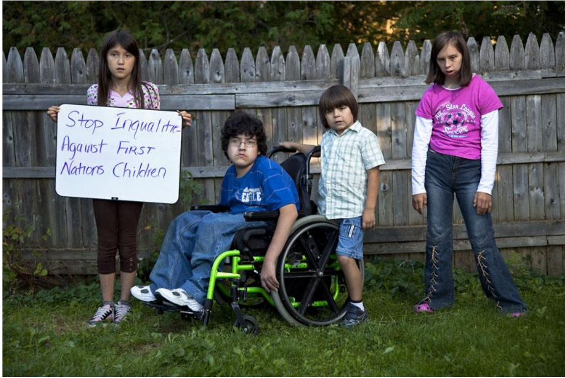
Children from Tobique First Nation.