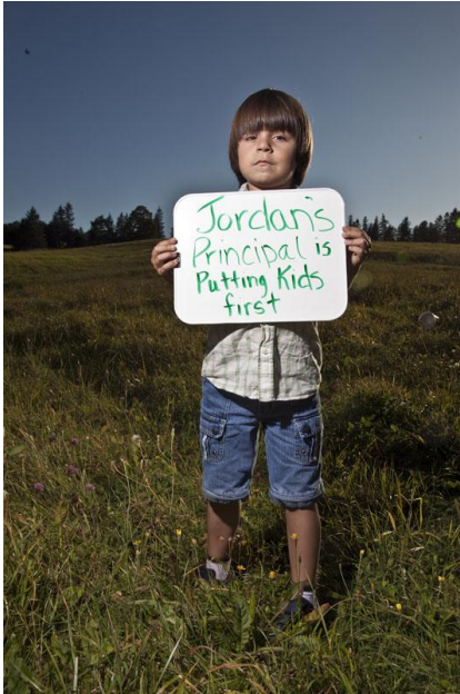
Child from Tobique First Nation